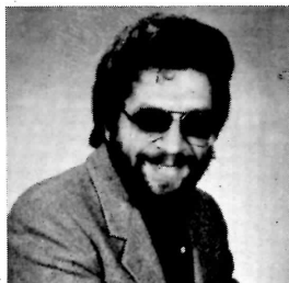
President and Founder of W.M.O.T. Records